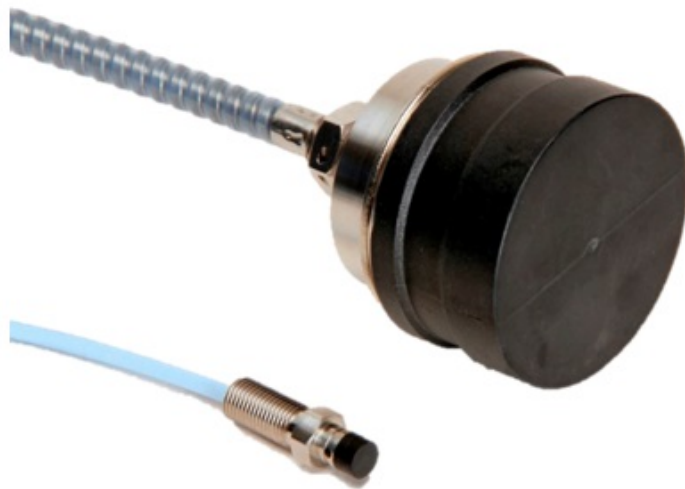
3300XL 8mm and 50mm Proximitors® probes

GE’s Bently Nevada takes the reliability and safety of our customer’s operations very seriously and over the years we have labored to earn your trust with your most critical machines. In turn you have come to trust in our solutions and our expertise, and the fact that we do not compromise when it comes to safety, quality, and reliability. This is our commitment to our customers now and into the future.