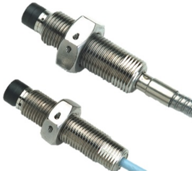
3300XL 11mm Proximitor® Probes, both Armored and Unarmored cable versions shown

With a fully interchangeable system like the Bently Nevada 3300XL, the plant simply replaces the damaged Proximitor or cable with an off-the-shelf spare part and continues to run, no calibration or special tools required and no need to disturb the probes installed deep within the machine. In fact, because of our gold standard and unmatched interchangeability, all of the machines at the plant can use exactly the same Proximitor drivers and cables and with a few different probe options, the plant’s entire needs can be covered by just a handful of spare parts shared amongst all the machines, which lowers maintenance costs and reduces the chances of system mismatch.